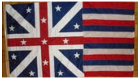
Innkeeper's View of Powder Horn Carving Unfurls Flag Debate