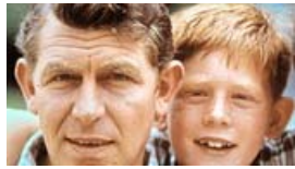
Opie Remembers His TV Dad