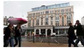
Hotels Provide Investment Comfort