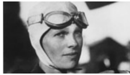
New Search for Amelia Earhart's Plane