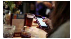
When Facebook, Twitter and Instagram Crash the Party